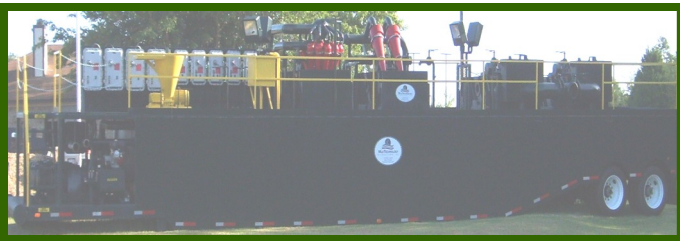
MCT-1000 HVU EX