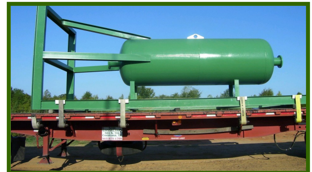
Poor Boy Degasser Gas Buster