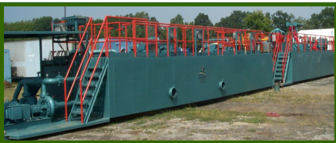
MCS-1000EX 2 Tank System

Our company is growing rapidly due to the reputation we are earning in the land based and offshore oil drilling industries.