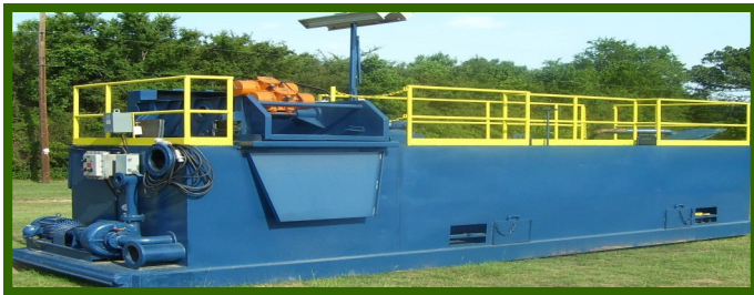
Mixing & Scalping Tank

Sales / Rentals / Manufacturing / Service