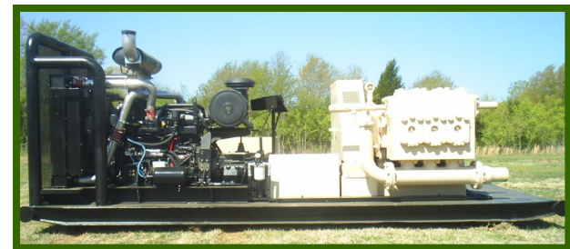
MTP-475 Auxiliary Mud