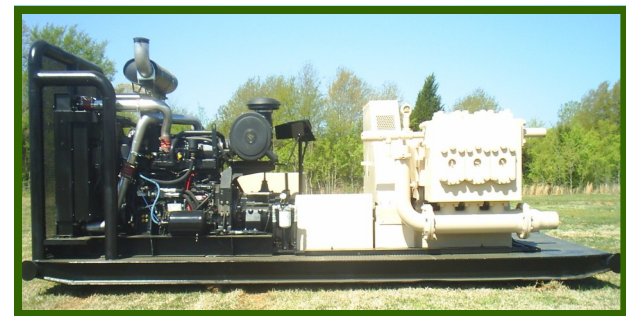
MTP-475 Auxiliary Mud